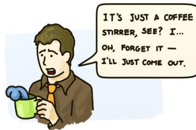
Figure 1: Coffee and gay identity

Coffee: the energy source of early risers, the non-alcoholic social beverage of choice for others and the addiction of millions. Coffee and its consumption have become entrenched into many parts of our society, and it has taken on its own rules, norms and standards. It has been grown to support nations, picked selectively to ensure power, and grinded in and against various identities. While you might think that your morning java is just a cup of hot, liquid, and delicious comfort, there is much more nuance that can be extracted from the bean. Coffee has become attached to various political, economic, social, and cultural meanings, which we see reflected throughout different vignettes in society. Thus, particular “coffee cultures” have been developed around social behaviors and social atmospheres that depend heavily on the process of coffee consumption.