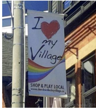
Figure 3: Banner Found at Church and Wellesley