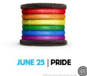
Figure 4: Oreo celebrating Pride month on Facebook

Commonalities based on representations and codes generate imagined communities. Most often, when those imaginaries of “who we are” and “what we stand for” come face-to-face with new meanings and understandings, frictions arise. Schultz, through his public declaration of the acceptance for the “mainstream homosexual agenda” made his coffee and brand queer. No longer could it be imagined that coffee, specifically Starbucks coffee, was only heterosexual. One example of how a particular coffee culture “grinded” against LGBTQ culture can be seen in a “gay quote” being pulled from Starbucks coffee cups (Seattle Times Staff 2005). 20 A more recent example of how coffee culture grinds against particular cultures is Tim Hortons’ decision to ban customers from using its WiFi to access a gay news website, due to the material not being age appropriate or “family appropriate.” 21 Coffee is not the first product to have seen controversy “boil over” over a company’s overt or covert support of a particular group’s identity. In recent news, Oreo, the popular chocolate cookie brand, was boycotted online for publicly supporting Pride month, with the subscript “made with the colours that do not exist.” 22