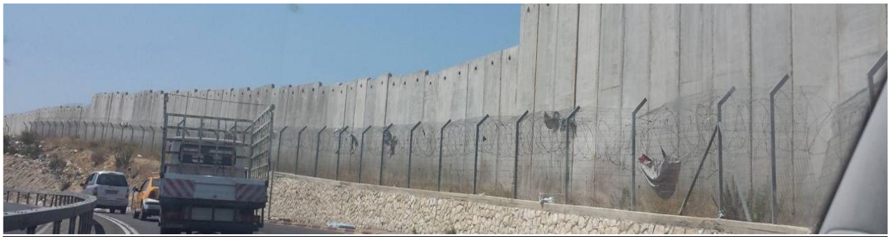
Figure 4: Israeli Apartheid Wall. A picture I took of the wall that separates Israel from the West Bank, which has harmed Palestinian communities and the environment, (2015).

Israel uprooted more than 100,000 trees and destroyed more than 36,000 metres of irrigation works to construct this wall. In addition, heavy machinery and millions of tons of concrete were used to construct it, consuming fossil fuels and water. The wall also interferes with natural drainage systems in the West Bank. Wrapping itself entirely around Palestinian towns, such as Qalqilia, the wall, thus, causes flooding and substantial environmental and agricultural damage during times of high rainfall. In February 2009, heavy rain flooded 15 hectares of land planted with vegetables and 1.5 hectares of citrus tree orchards, in Qalqilia, destroying the crops. Besides providing Israel a tool for land grab and control of Palestinian movement, Israel's apartheid wall devastates the environment, providing another example of how social harm causes environmental harm and vice versa.