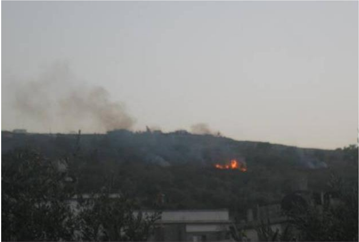
Figure 1. Olive Trees on Fire. A photo taken by my brother of the fire, which was started by Israeli settlers on the hills of our village of Madama, located in the occupied West Bank, (2015).