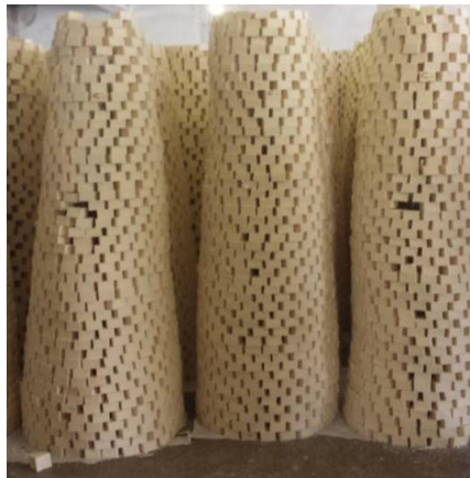
Figure 8. Nabulsi soap. I took this image of Palestinian soap made out of olive oil while visiting the Touqan soap factory, which opened in Nablus in 1894, (2015).

watermelons), and others were all “intensively cultivated” by Palestinians and became reputed for different produce. In December 1945 and January 1946, a Survey of Palestine was conducted and published by British Mandate authorities, on behalf of the UN Special Committee on Palestine. It revealed that during the 1944-1945 planting season, about 5 million pounds of grains, 7 million pounds of vegetables, 4 million and a half pounds of fruits (excluding citrus) and 3 million pounds of olives were produced, largely by Palestinian farmers. Furthermore, crops, such as wheat, barley, lentils, peas, chickpeas, and bitter vetch were cultivated in the region for more than 5000 years, (Orenstein et al. 2013, pg. 32).