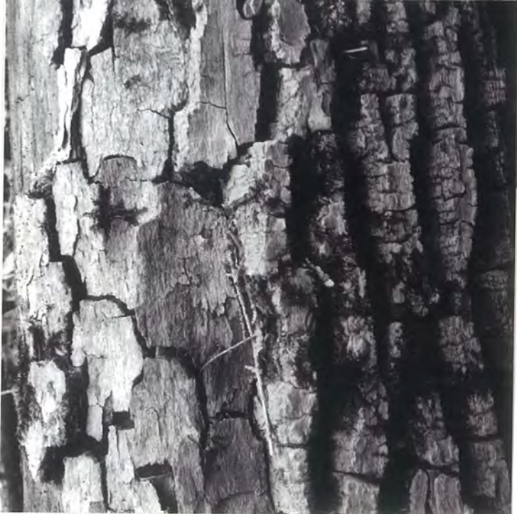
"Rock, Paper 87 , Scissors"