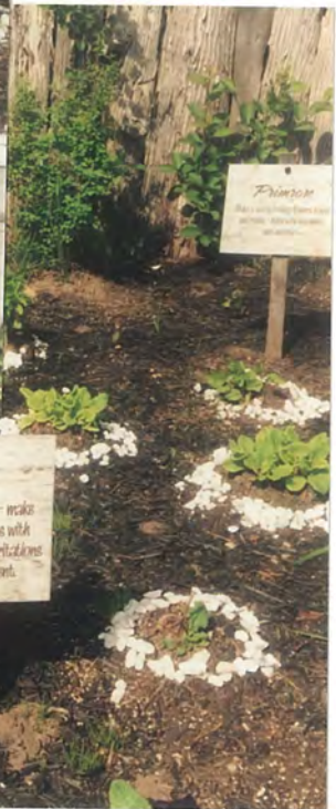
Viola Use flowers, leaves and stems - make tea or put into salads. Assists with whooping cough, arthritis, skin irritations and is also a detoxifying agent.