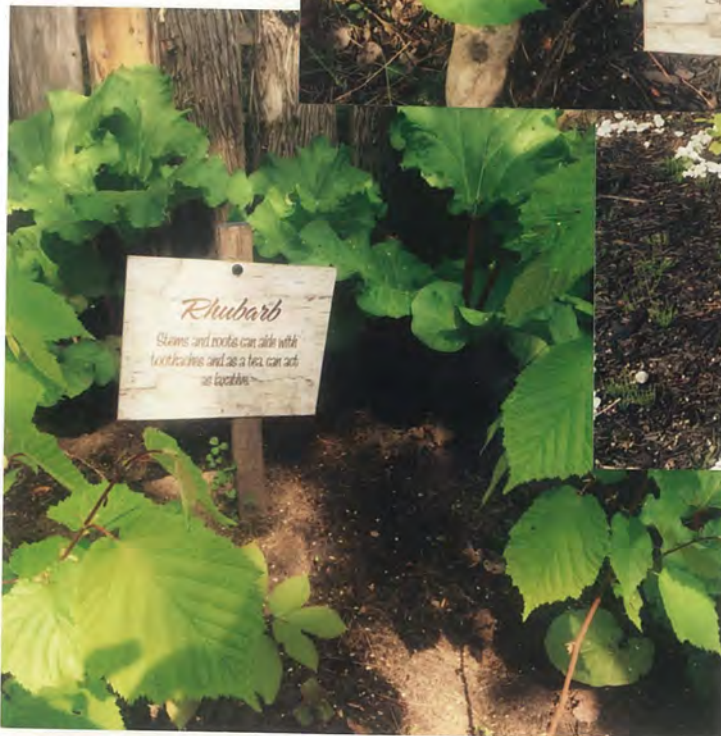
Rhubarb Stems and roots can take with vegetables and as a tea can act as laxative.