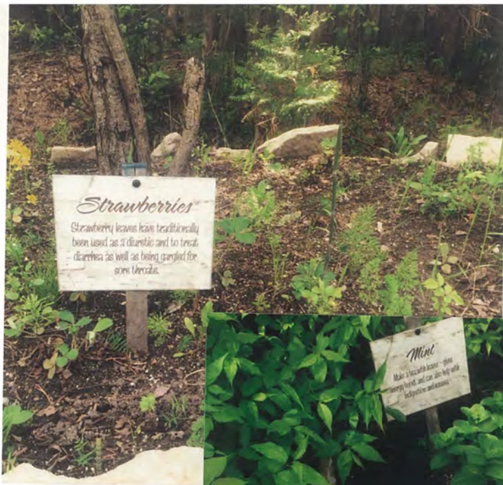
Strawberries Strawberry leaves have traditionally been used as a diuretic and to treat diarrhea as well as being gargled for sore throats.