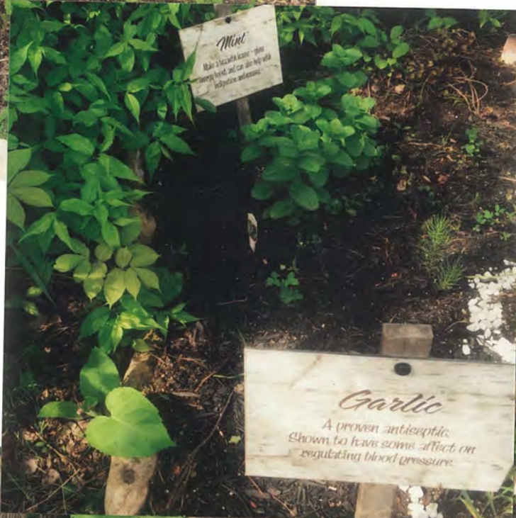
Mint Make a health tonic - place leaves in a jar and can use with honey and lemon.