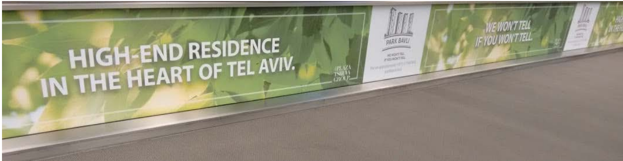
Figure 3 - Promotional sign for Park Bavli development. Captions read "High-End Residence in the Heart of Tel Aviv" and "We Won't Tell if You Won't Tell."