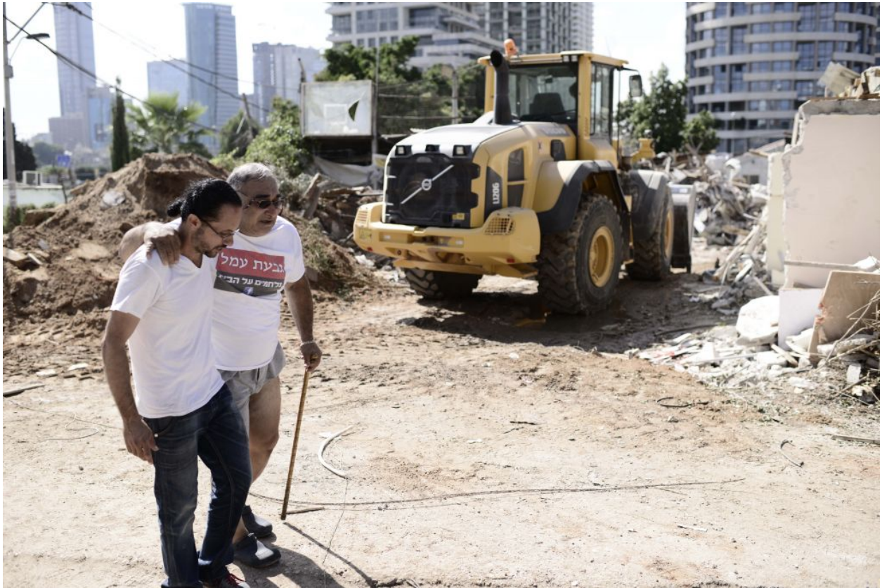
Figure 2 - Residents of Givat Amal being evacuated on 21 September 2014.