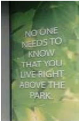
Figure 4 - Promotional sign for Park Bavli development. Caption reads "No One Needs to Know That You Live Right above the Park".

The proposed projects include the four-tower, 46 story “Park Bavli” development, which will include approximately 700 condominiums, and the 44 story “BeReshit Tower,” which will have 174 condominiums. The Park Bavli advertisement campaign follows a theme of secrecy, with the ads saying such things as “nobody needs to know that you live right above the park” and “nobody needs to know that there’s a secret spa in your building.” This supposed secrecy is meant to give the project a sense of prestige that is only available to those in the know, yet the greatest secret of the project, which is not advertised to the potential purchasers of units in the project, is that the secret park in which the towers will be built covers the ruins of a neglected urban slum, built on the ruins of a depopulated Palestinian village. 410