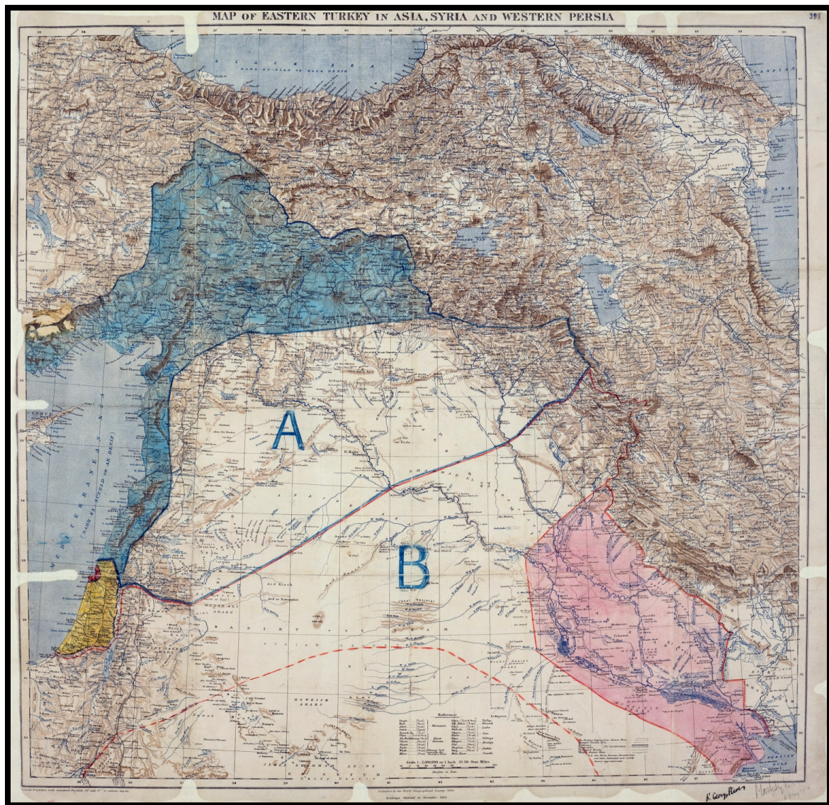
Figure 2: MPK1-426 Sykes Picot Agreement Map signed 8 May 1916 by Royal Geographical Society: UK.