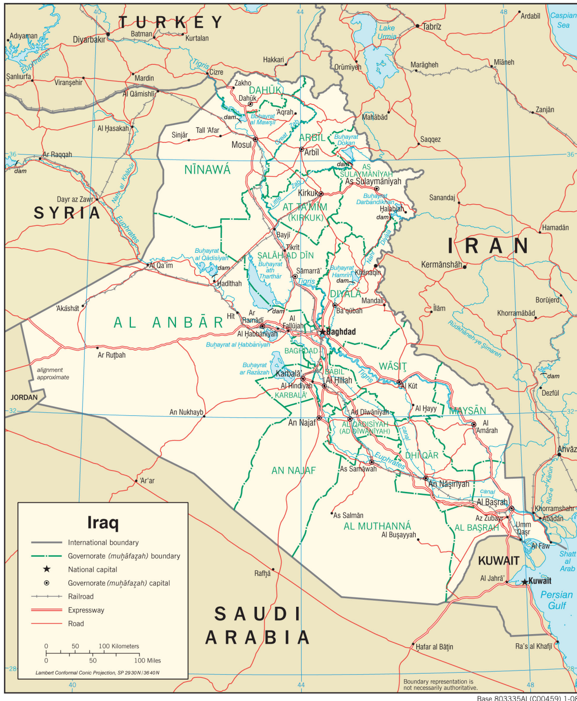
Figure 1: Iraq (Political) map, 2009, USCIA. Perry-Castaneda Library Map Collection http://www.lib.utexas.edu/maps/iraq.html