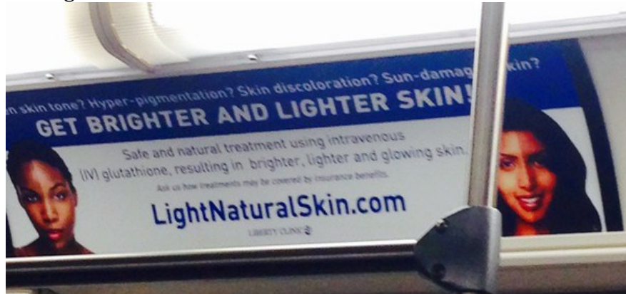
Illustration 5: LightNaturalSkin.com

(Source: Posted online by Twitter user @EmilyKnits on Dec 14, 2014)