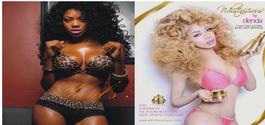
Illustration 4: Dencia