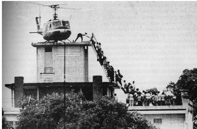
Figure 1. Vietnamese civilians trying to board a U.S. helicopter near the U.S. embassy in Saigon, 1975.

I then charted the field of what I call “critical refugee studies,” a term which I will summarize at the end of the talk. Essentially what I wanted to do was to (re)conceptualize “the refugee” in academic discussion and popular discourse not as an object of rescue, but rather as a paradigm “whose function [is] to establish and make intelligible a wider set of problems” (Agamben 2002: 1) such as colonialization, war and displacement. Instead of looking at Vietnamese refugees as people that we assimilate and make into a success or continue to see as a problem, I argue that we should look at them as a critical site of social and political critique. As you trace their lives, other erased histories will become visible, like the history of U.S. colonialism