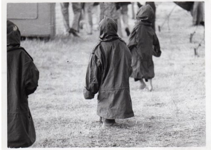
Figure 3 – Young Vietnamese refugee children walk through one of the refugee camps aboard Camp Pendleton, California. Photo taken on 5 May 1975 by Major G. L. Gill. (Photo courtesy of Camp Pendleton Archives).

I want to end with an image that visually depicts what I’m trying to say about militarized refuge. This is a photograph from the Camp Pendleton Historical Society photo exhibit in 2010 (see Figure 3), which was the thirtieth anniversary of the fall of Saigon. Dated May 5, 1975, it depicts several Vietnamese children walking barefoot around the Camp, their whole bodies engulfed in extra-long military jackets. Undoubtedly, the gesture was meant to be kind and the jacket intended to warm their bodies against the morning cold—it was very cold for Vietnamese, even in California. Yet this picture, I would say, encapsulates so vividly the concept of militarized refuge(es) , with young Vietnamese