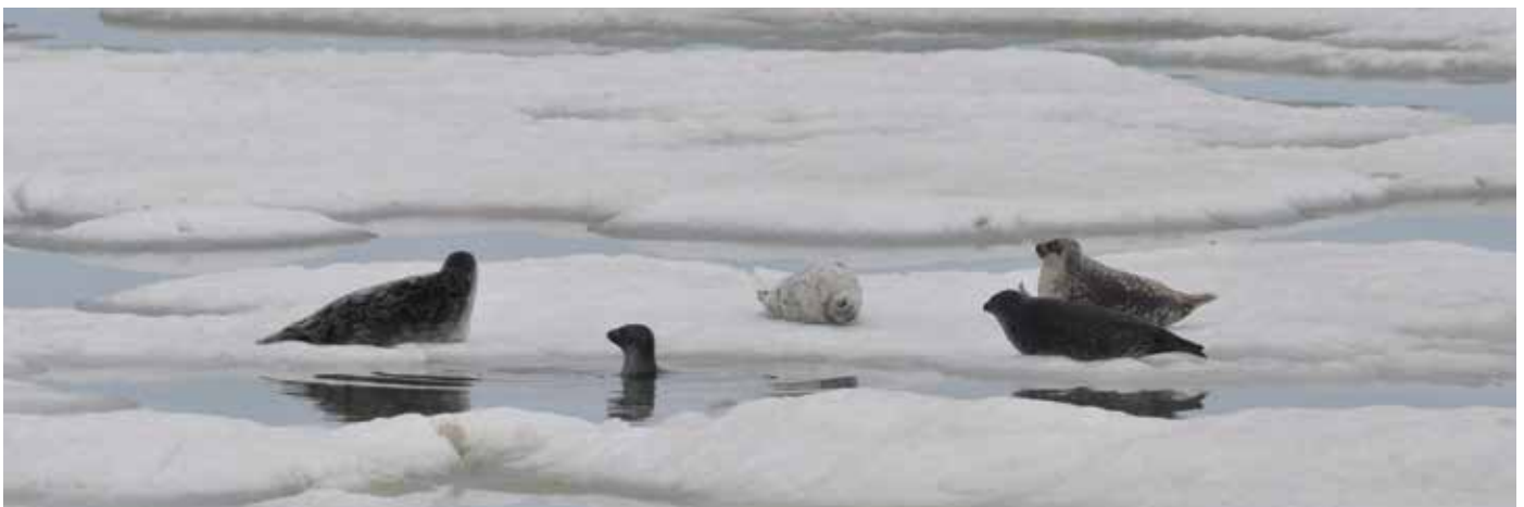
2012 – ringed seals hauled out on spring ice – Hudson Bay off the Manitoba Coast