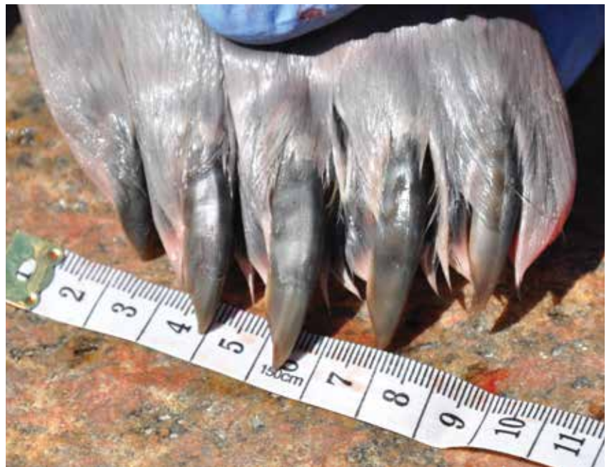
2012 – annual lines in ringed seal claws

It is hoped that the experiences and findings from this workshop can be a stepping stone for future actions, including additional workshops in other jurisdictions. The participants at this workshop made important connections, both with one another and in the context of identifying the steps needed to continue to create success in their work with ringed seals. One of the important factors that contributed to the success of this workshop was the focus on ideas and solutions at multiple scales – at the community level, at the institutional research and managerial levels, and at the individual level in building long-term understanding between community members, researchers, and managers.