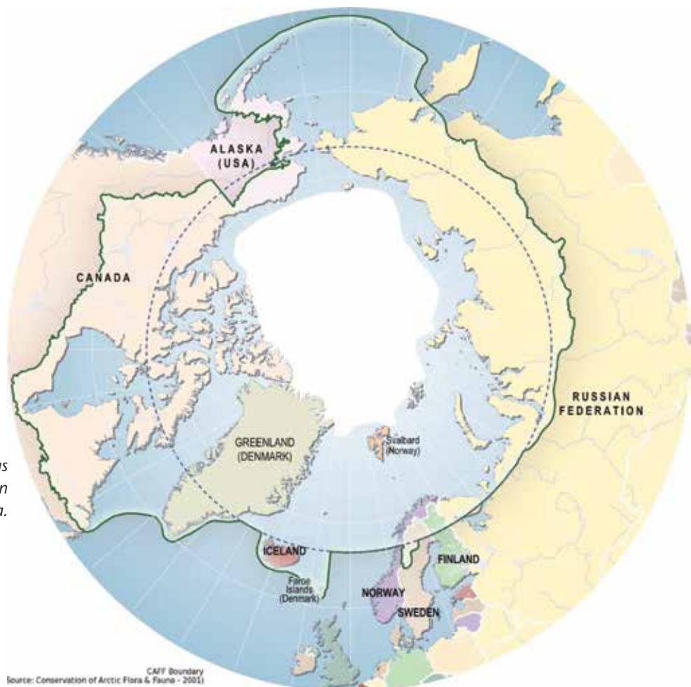
This map shows the geographical areas included in the Arctic by the Conservation of Arctic Flora and Fauna.

Ringed seals ( Pusa hispida ) are the most abundant Arctic seal, with a range that extends throughout the circumpolar marine region. Ringed seals have adapted to survive in environments with periods of ice cover, constructing breathing holes through both land-fast and pack ice to maintain access to air and ice platforms. Ice platforms provide critical habitat where ringed seals haul-out in the spring during the annual moult, and on which pregnant females construct birth lairs beneath the snow for protection of pups against both predators and weather. Mating occurs under the ice and, after a 10 to 11 month gestation period that includes a 2 to 3 month period of suspended development, ringed seals give birth to a single pup in March or April. The time following birthing is an important feeding period for ringed seals to regain body mass lost throughout birthing and lactation, at which time females forage for food and tend pups. A general seasonal cycle in energy acquisition characterizes ringed seal condition with a negative energy balance overwinter and a positive energy balance through the open-water season. Ringed seals eat a wide variety of prey which vary with location and season, but predominantly include Arctic cod