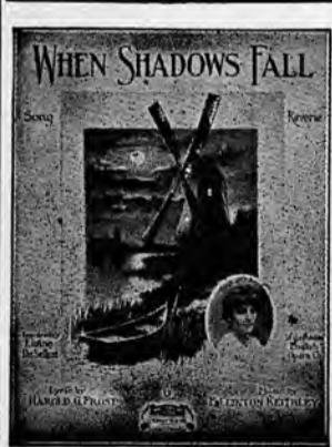
The Concert Ballad Success