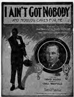
Most Popular "Blues" Song Ever Written