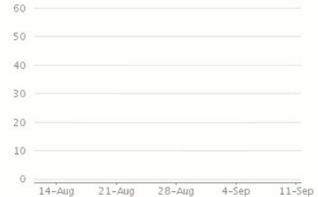
Issues: 30 Day Summary

get stuff done! form bonds, mentorship, a sense of accomplishment, stronger code base, stronger & more sustainable community