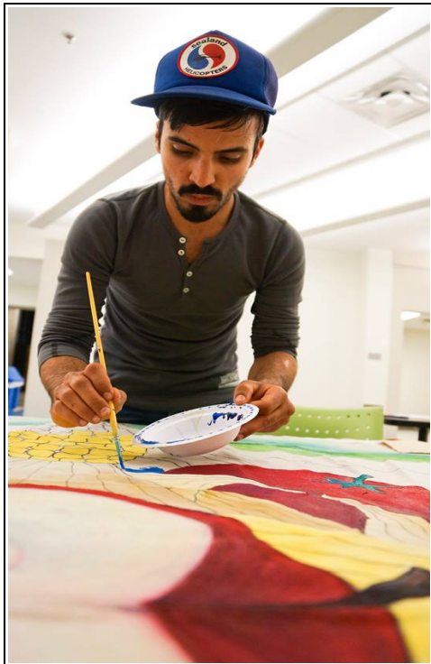
(Painting participant, May 9 th , 2014)