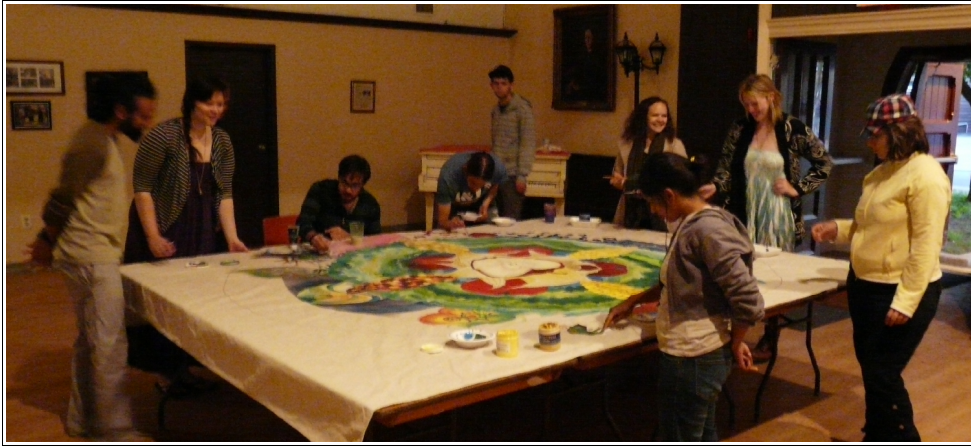
(Participants painting in Church of St.Stephen, June 5 th , 2014)