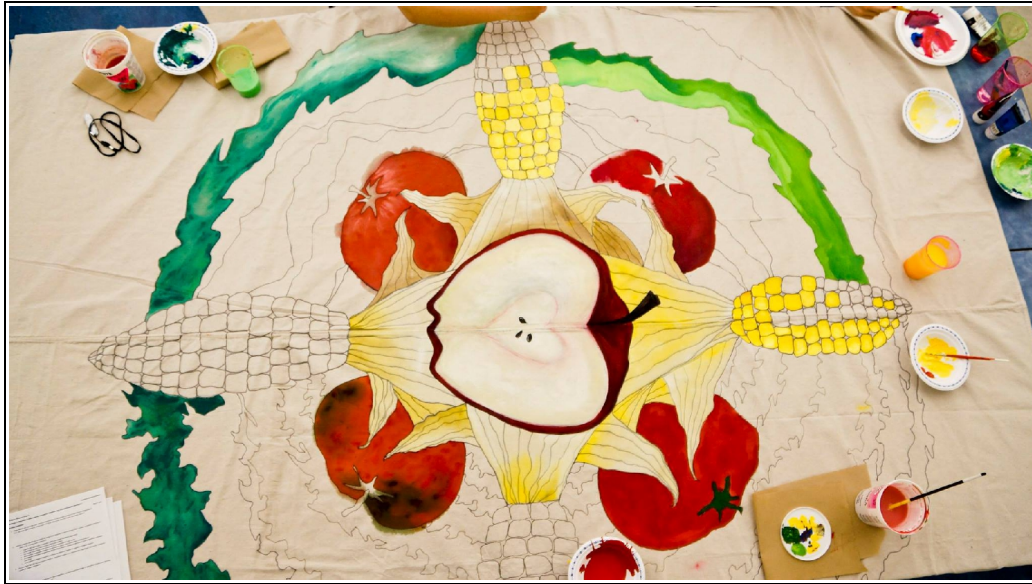
(Mural painting in process, May 9 th , 2014)