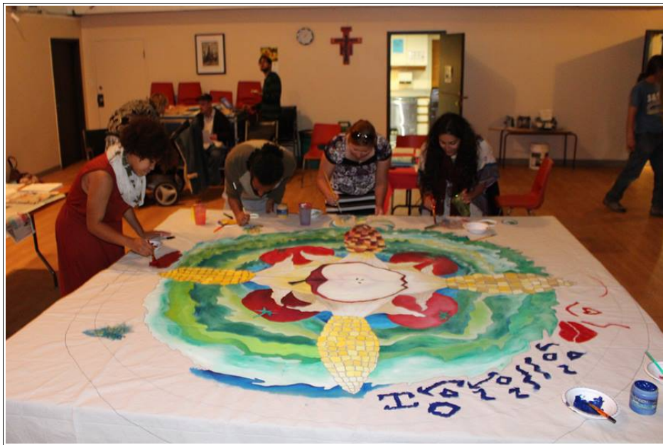
(Participants and myself painting in Church of St. Stephen, June 5 th , 2014)