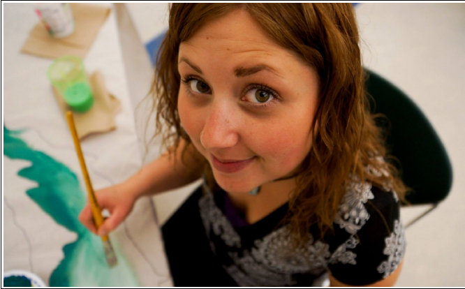
(Myself painting, May 9 th , 2014)