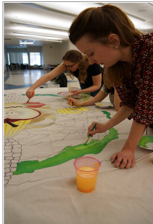
(Painting participants, May 9 th , 2014)