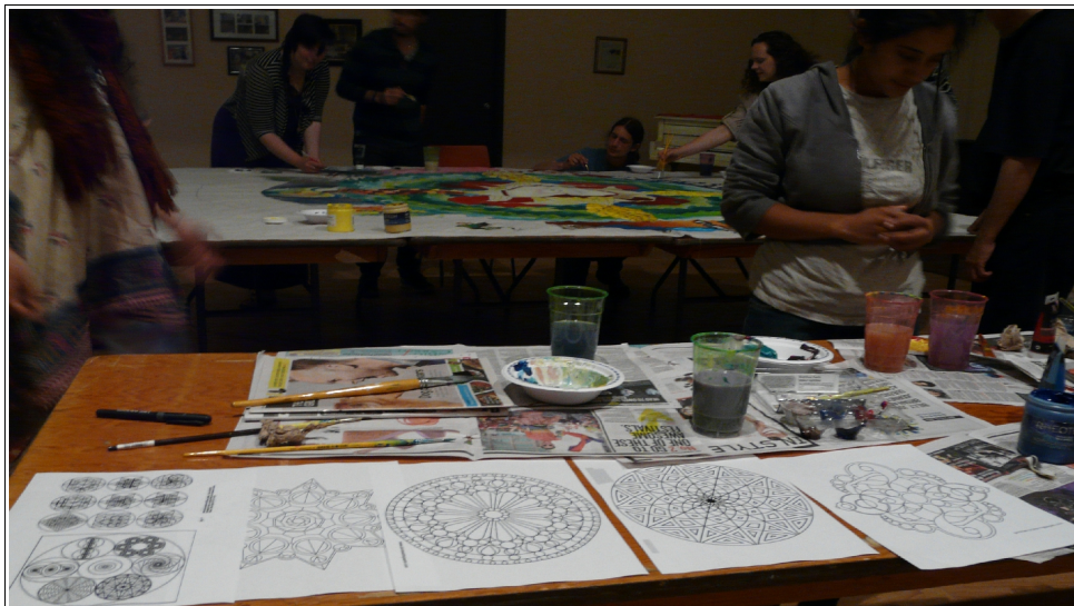
(Inspirational geometric designs, paint, and participants, June 5 th , 2014)