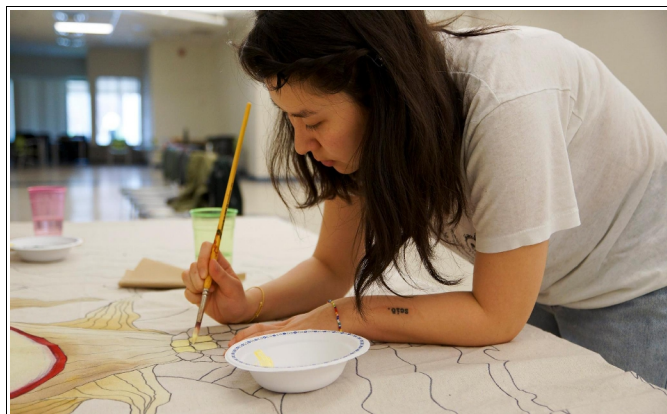
(Participant painting, May 9 th 2014)