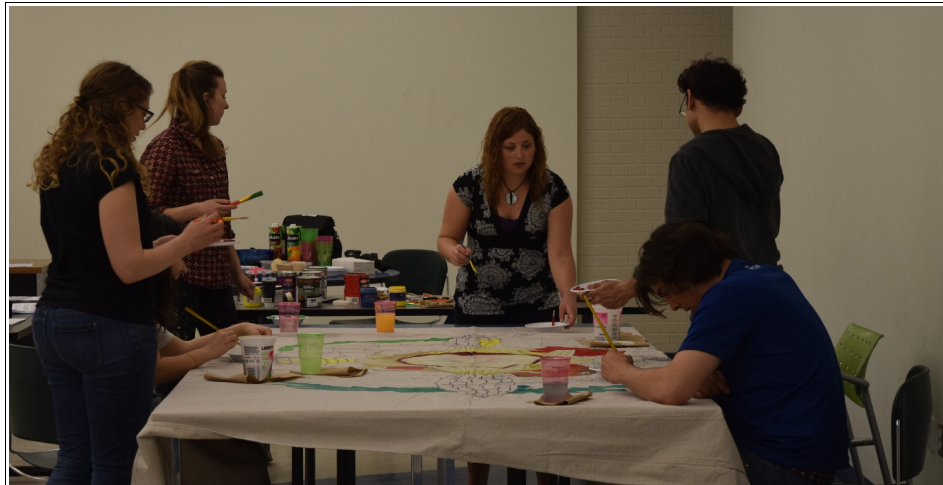
(Myself facilitating with participants, May 9 th , 2014)