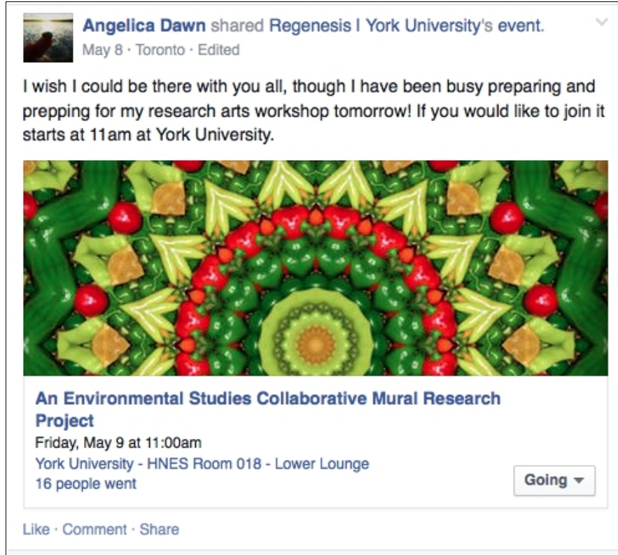
(Facebook event page preview via Regenesis at York University, May 8 th 2014)