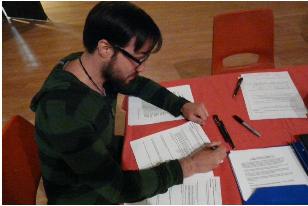
(Participant filling out interview questionnaire, June 5 th 2014)