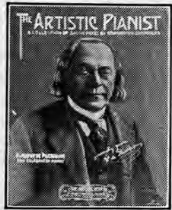
VLADIMIR DE PACHMANN