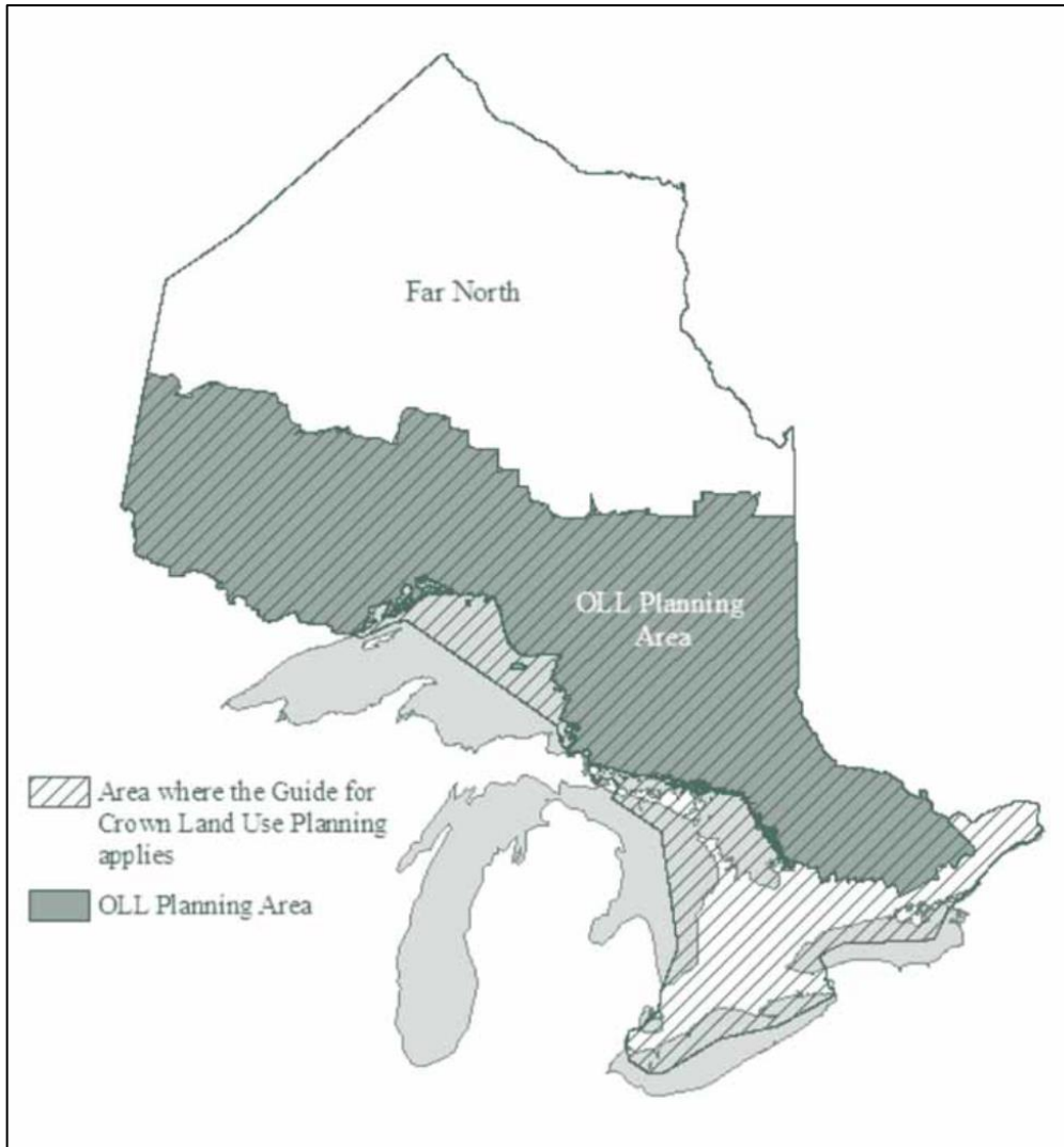
Figure 2. The Ontario Lands for Life planning area, and the Far North which is not subject to LUP for Crown lands under the Public Lands Act.