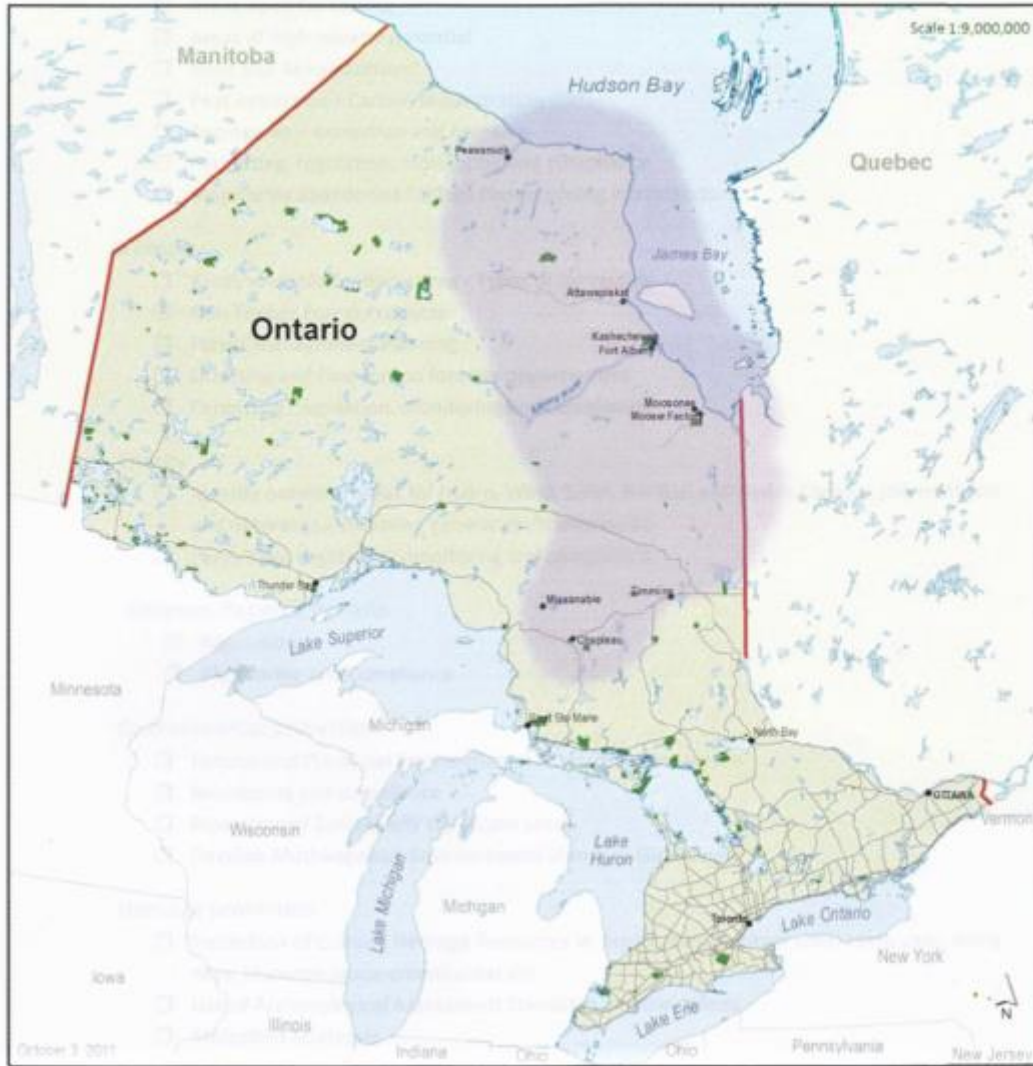
Figure 5. The Mushkegowuk homeland (Mushkegowuk Aski) shaded in purple. Source: Mushkegowuk Lands and Resources (August 10, 2012). Draft Terms of Reference: Mushkegowuk Regional Land Use Plan.