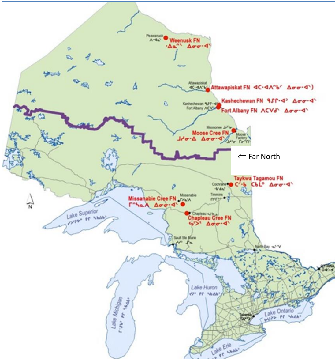
Figure 1. First Nation communities of the Mushkegowuk Council, with the Far North boundary (purple line). Modified from Mushkegowuk Council, Lands and Resources (n/d).