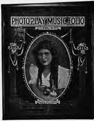
Photo-Play Music Folio

Arranged in Medium Grade The characters of the Opera, together with a brief synopsis of the Libretto, date and place of first Performance, Birth, and Death Year of Composer and other Important Items are also included in these volumes. CONTENTS Vol. I. Selections From "Carmen" by Bizet "Faust" by Gounod "Aida" by Verdi "Bohemian Girl" by Belfe Volumes 1, 2 and 3 now ready