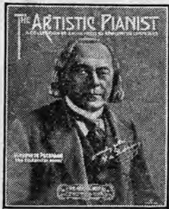
VLADIMIR DE PACHMANN