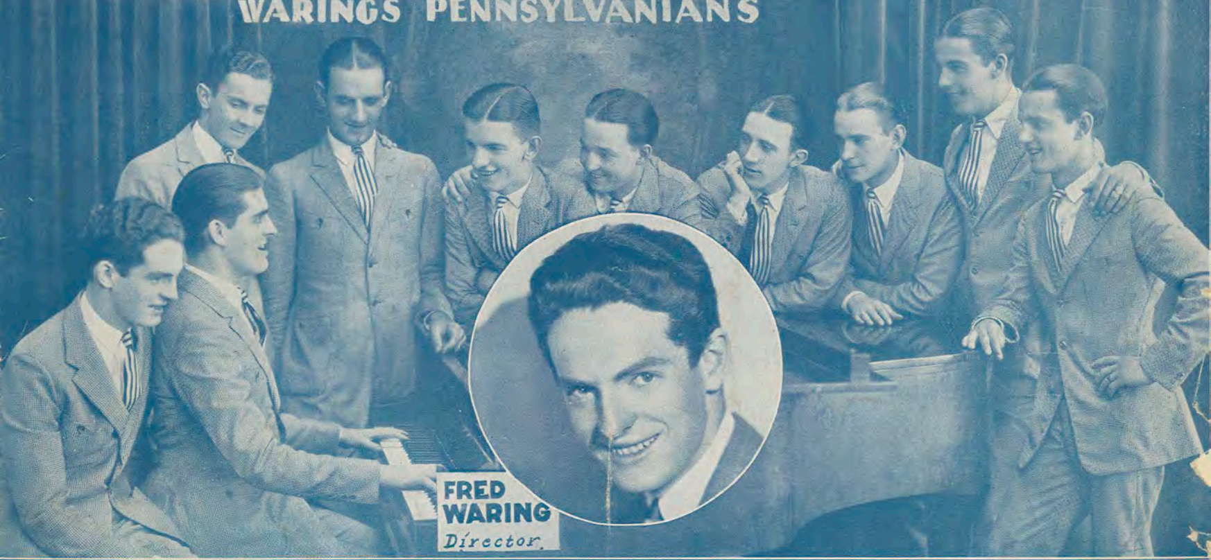
FRED WARING Director.

Words by B. G. DE SYLVA Music by VINCENT ROSE Composer of "Love Tales" "Linger Awhile" etc.