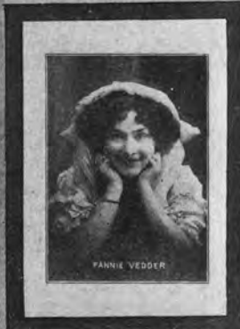
THE YORK MUSIC CO. ALBERT VON TILZER, Mgr. 1367 BROADWAY, N.Y.