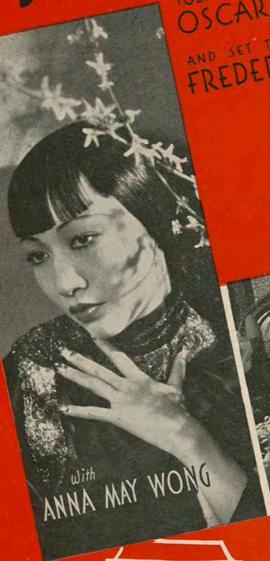
With ANNA MAY WONG