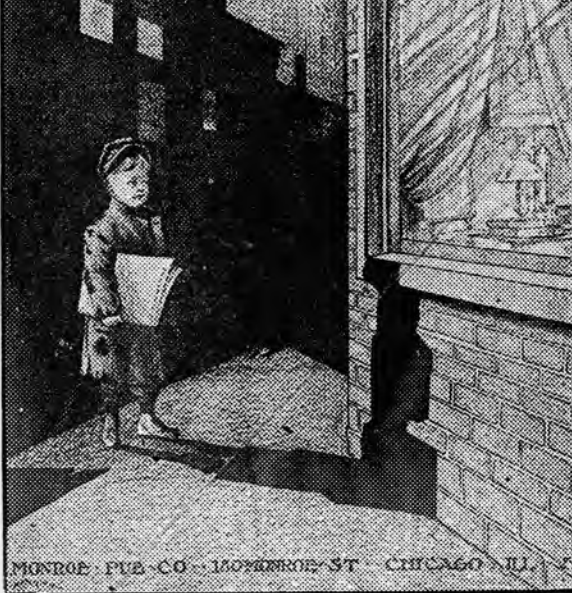
MONTGOMERY PUBLISHING CO. - MONMOUTH ST. - CHICAGO, ILL.