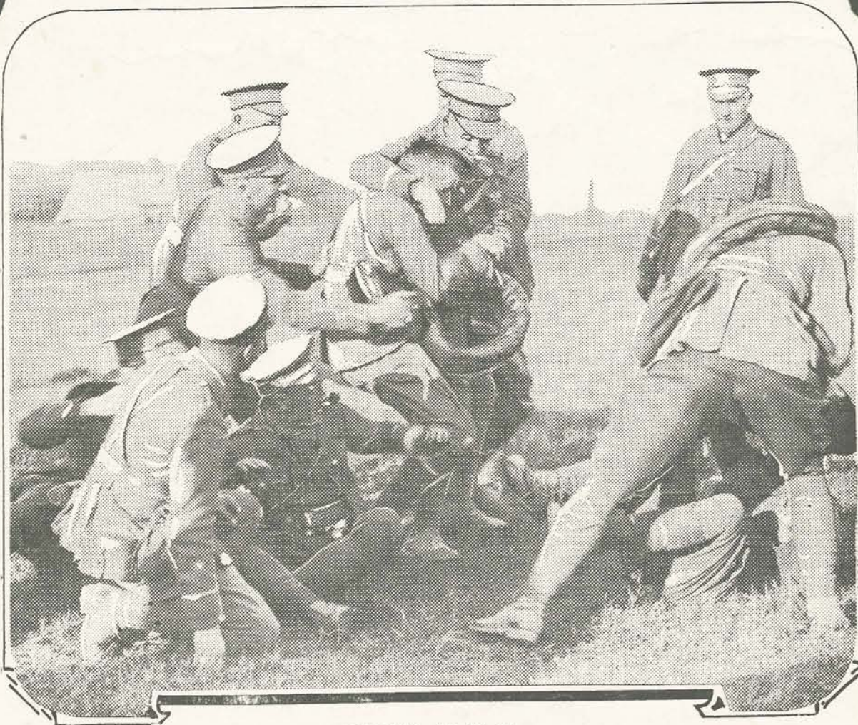
OFFICERS AT PLAY