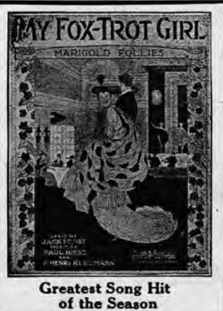
Greatest Song Hit of the Season

Complete Copies on Sale Wherever Music is Sold!