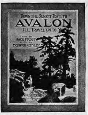
Popular Song Success