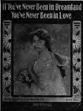
Popular Waltz Ballad