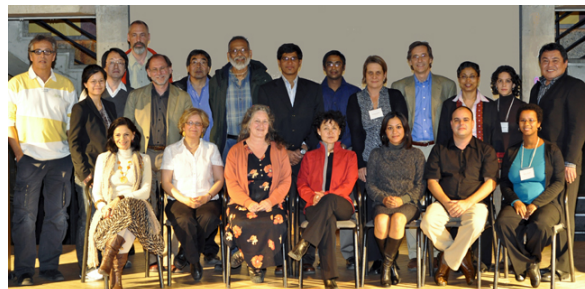
The conference speakers and the organizing committee