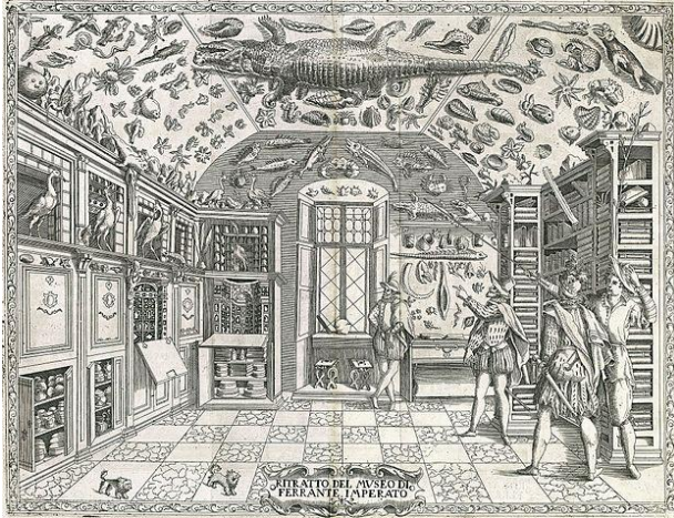
Fig. 3.1. Wunderkammer , appearing in Dell'Historia Natvrale di Ferrante Imperato (Imperato).

The Wunderkammer 's central function was to bring together a varied selection of unusual and extraordinary objects, 4 including diagrams, feral specimens, bizarre instruments for experimentation, and rare works of art. While the objects appearing in these Wunderkammern were out-of-place because they represented fragments of an elsewhere land, they functioned to represent a cultural totality of the worlds they depicted. Samuel van Quiccheberg, author of Inscriptionnes , a 1565 treatise on museums, noted that Ferrante Imperato's first rendering of a Wunderkammer (depicted in fig. 3.1.) represented "a theatre of the broadest scope, containing authentic materials and precise reproductions of the whole of the universe" (Quiccheberg qtd. in Mauriès, 23). These spaces, according to Quiccheberg, were universal exhibitions; objects from the world over were collected, arranged, and displayed, resulting in viewer curiosity and engagement.