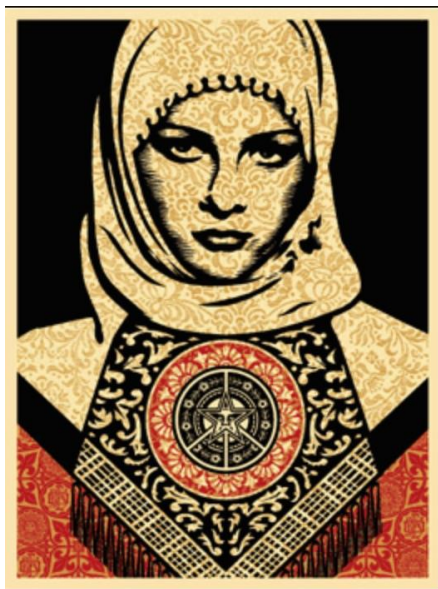
Fig. 1.2. “Arab Woman (Red)” (Fairey “Arab Woman”)

museumgoers. For example, the “OBEY Giant” collage appeared near the “Revolutionary Muslim Woman” portrait, which was curated side-by-side another image titled “Rise Above Cop.” Themes of hope and change weaved through each section of the exhibit and I wondered how the curator’s choices helped enhance that message. Like Alexander MacDonald in No Great Mischief , the Fairey exhibit’s curator relied on a particular presentation and juxtaposition of artifacts and fragments to help viewers see something new in Fairey’s work. In both MacLeod’s novel and the Fairey exhibition, these meanings were not clearly prescribed to viewers. Instead, viewers had to piece together the artifacts in order to manifest and then come to understand the subtle arguments being made.