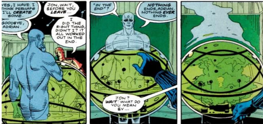
Fig 3.2. Final panel in Watchmen #12 (Moore, “A Stronger Loving World”)