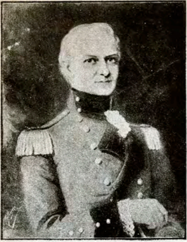
Major General, The Hon. Aeneas Shaw Revolutionary War and 1812, 1815