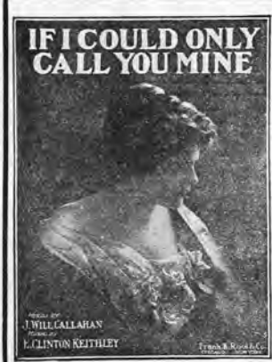
One of our Best Songs