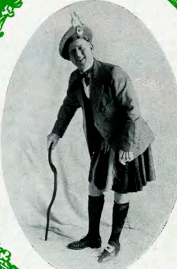
"DADDY'S BONNIE BOY"