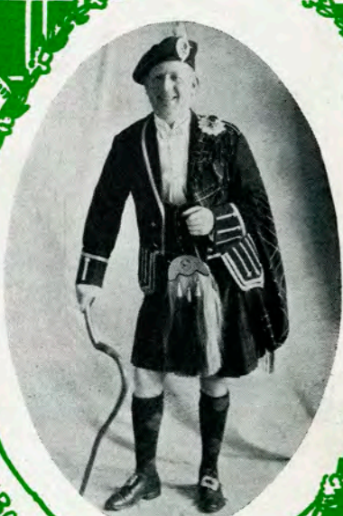
"BONNY HIGHLAND MAGGIE"