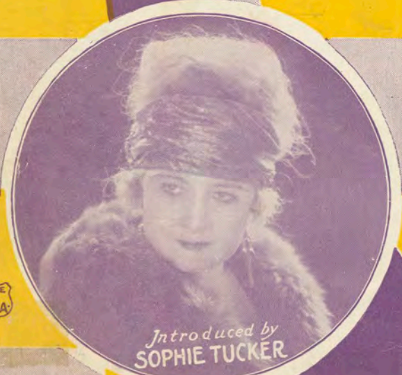
Introduced by SOPHIE TUCKER