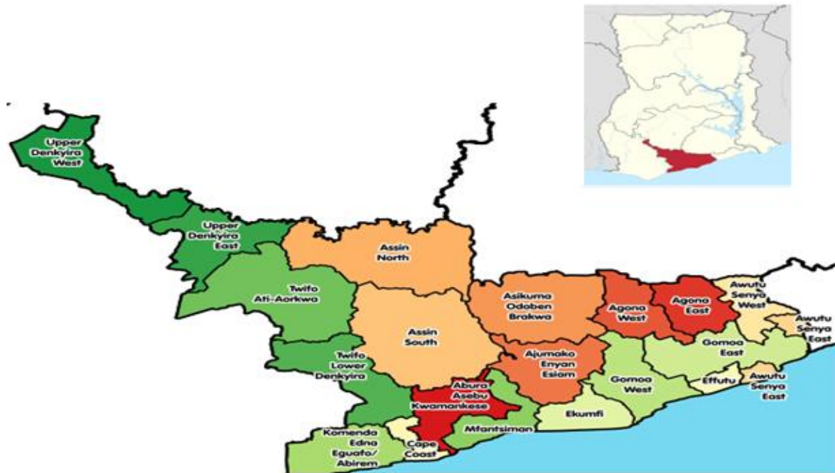
Figure 3.1.1. A Map of the Central Region of Ghana and its 20 districts 21

Known as the ‘citadel of education’, the Central Region is renowned for its numerous elite second cycle and higher education institutions. In total, there are 68 public second-cycle institutions (65 of which are public SHSs and 3 public technical schools) and 12 private second-cycle institutions (Ghana Senior High Schools Annual Digest 2017/2018). In Ghana, both private and public SHSs are categorized into the MOE/GES classification scheme of Category A to Category E schools, with Category A and B being the elite public SHSs, Category C and D schools being lower performing and less endowed 22 public and private SHSs, and Category E schools being the specialized technical schools.