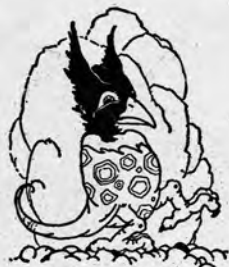
THIS IS A FUZZY WUZZY BIRD

The most original and rhythmic novelty since the famous "Hindustan"