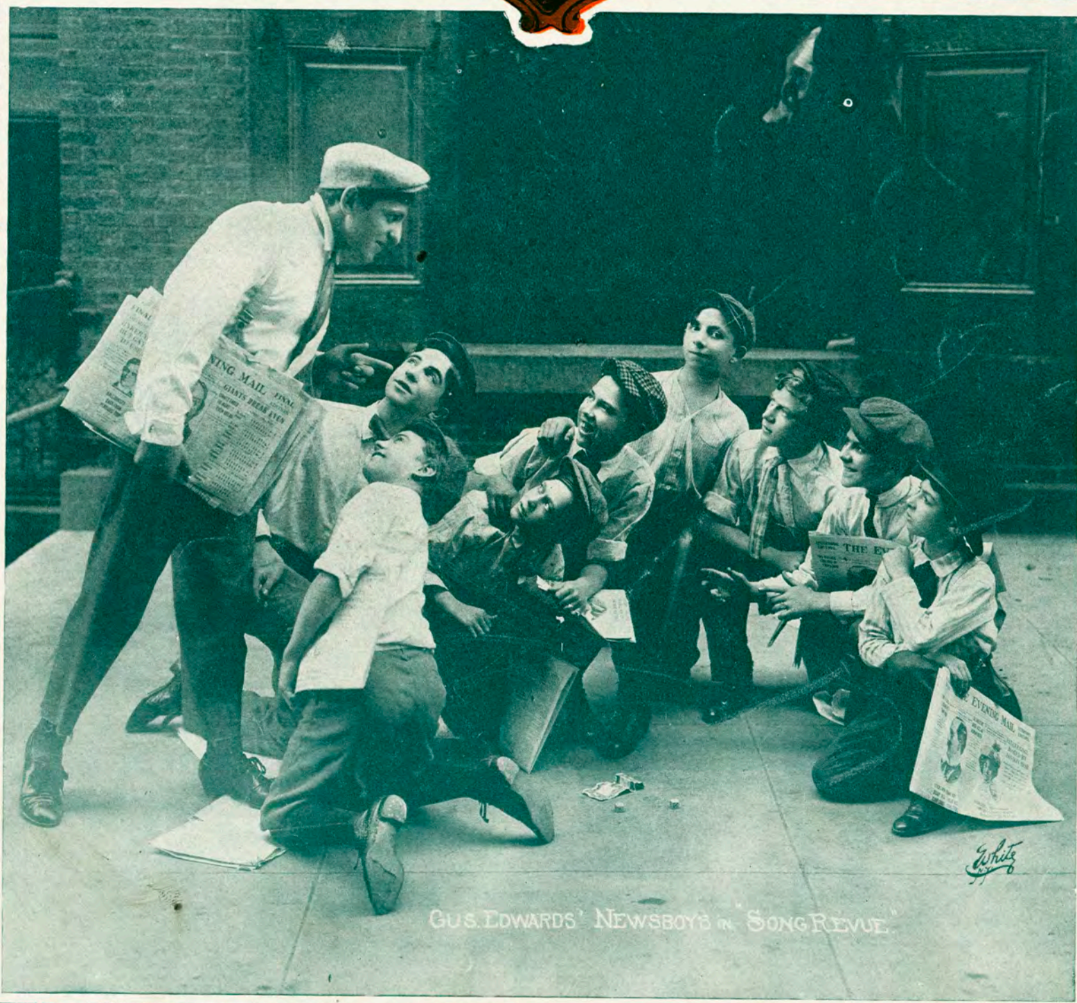
GUS EDWARDS' NEWSBOYS IN "SONG REVUE"