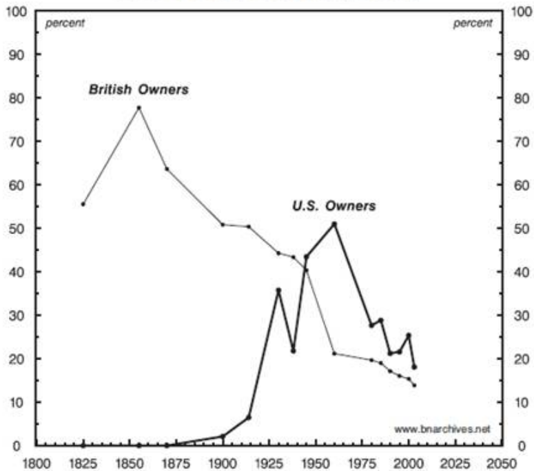
Figure 2 Share of Global Gross Foreign Assets

NOTE: Gross foreign assets consist of cash, loans, bonds and equities owned by non-residents. The last data point is for 2003.