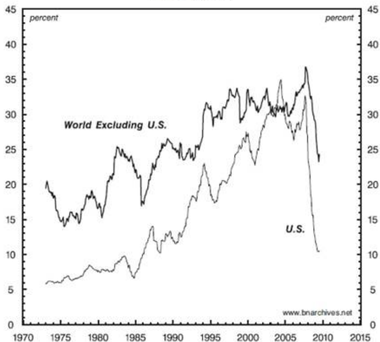
Figure 4 Net Profit Shares of Listed FIRE Corporations (% of Region)

NOTE: Net profit is computed as the ratio of market value to the price-earning ratio. Total and FIRE profit for firms outside the U.S. are calculated as a residual, by subtracting from the world figures the corresponding figures for the U.S. The last data points are for July 31, 2009.