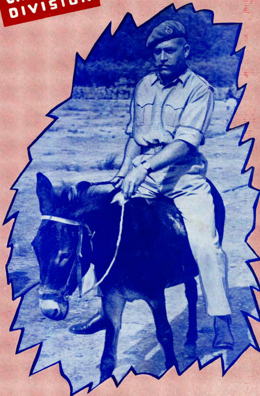
Major-General Chris. Vokes, O.B.E., D.S.O., General Officer Commanding the 1st Division, who commissioned and adopted this song