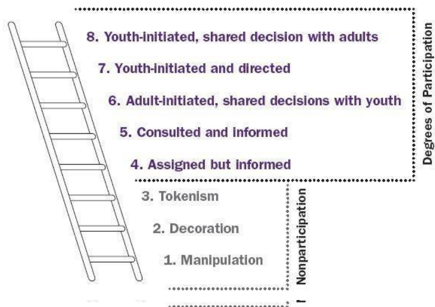
Figure 3: Ladder of participation (Hart, 1992).

initiatives. This rather rapid shift, from the perception of youth as inconsistent and untrustworthy to fully capable, rational, and thus deserving of “voice”, is not often considered by student voice scholars, other than to remark on its incompleteness. Indeed, many student voice scholars lament what they describe as a persistent perception of young people as developmentally unprepared to act participants in the rational world of policy (Fielding, 2004; Mitsoni, 2006; Schratz, 2005).