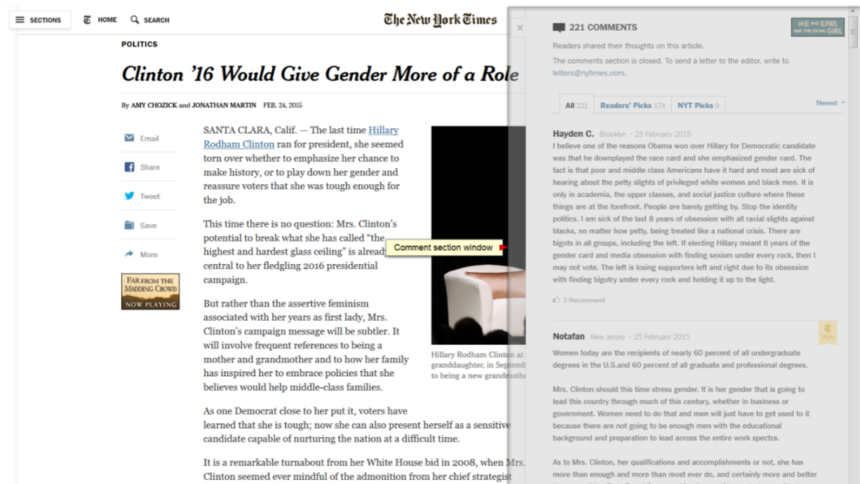
Figure 1: New York Times Comment Section

available comments. Instead, I captured the first few threads 11 in each video. I collected 415 comments from six different threads from “More Feminist Fails For 2015,” and 511 comments from four different threads from “WHY I’M A...FEMINIST *gasp*.” On the Globe and Mail website, I captured the full comment section attached to each article, for a total of 835 comments. The New York Times website presented some difficulties: instead of being situated at the bottom, in the same window as the article itself (which is the case on the Globe and Mail website as well as on YouTube ), comments on the New York Times website pop up in a new window, internal to the window the article is in. (See Figure 1)