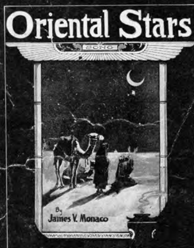
ONE STEP SONG