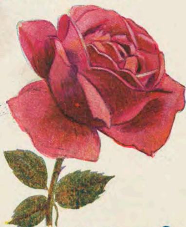
RED RED ROSE

Book Written and Staged by Wm. ANTHONY McGUIRE Music by WALTER DONALDSON Lyrics by GUS KAHN Dances Staged by SEYMOUR FELIX