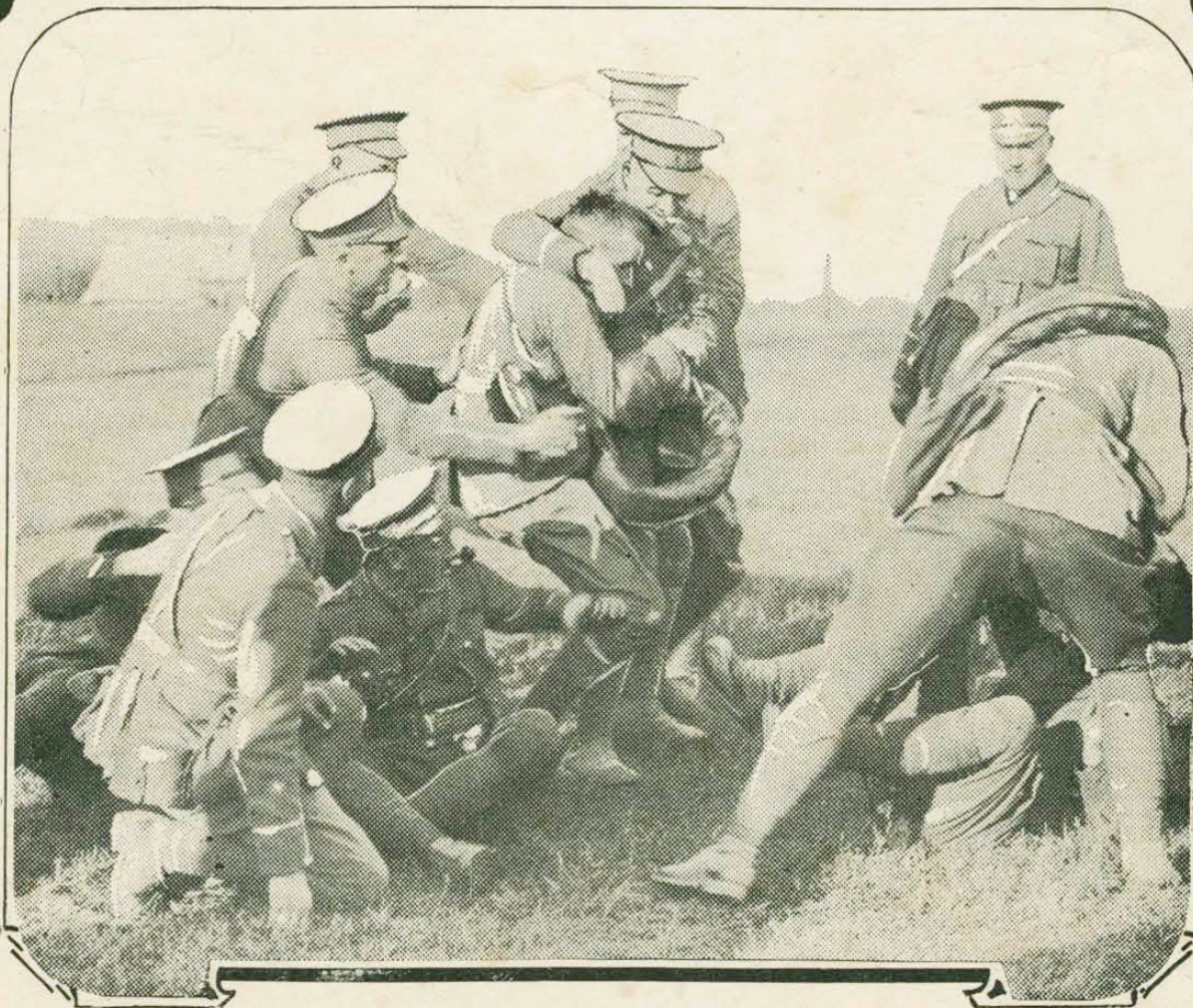
OFFICERS AT PLAY