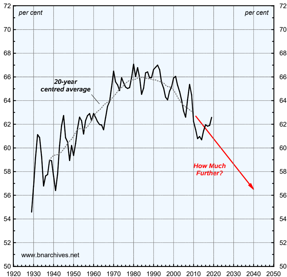
Figure 1. U.S. Share of Employee Compensation in National Income, 1929-2019

SOURCE: U.S. Bureau of Economic Analysis through IHS Markit (series codes: YN for national income; YP-COMP for compensation of employees).