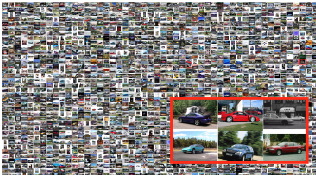
Figure 1: Screenshot of a collage of cars from GeoCities, overlaid with a zoomed-in portion (red box).

For example, GeoCities was (rather uniquely) arranged in thematic clusters called “neighborhoods”, such as sites about philosophy in “Athens”, cars in “MotorCity”, and pets in “Heartland”. Using object detection, we can find clusters of images that can suggest the existence of coherent communities. Did websites that were “near” each other in virtual space use similar images?