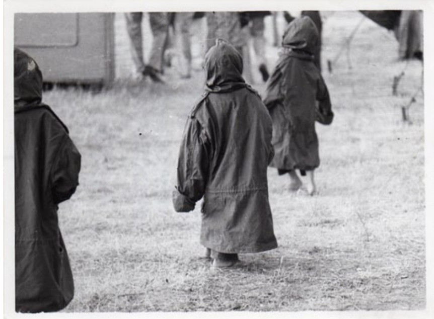
Figure 3 – Young Vietnamese refugee children walk through one of the refugee camps aboard Camp Pendleton, California. Photo taken on 5 May 1975 by Major G. L. Gill. (Photo courtesy of Camp Pendleton Archives).

I want to end with an image that visually depicts what I'm trying to say about militarized refuge. This is a photograph from the Camp Pendleton Historical Society photo exhibit in 2010 (see Figure 3), which was the thirtieth anniversary of the fall of Saigon. Dated May 5, 1975, it depicts several Vietnamese children walking barefoot around the Camp, their whole bodies engulfed in extra-long military jackets. Undoubtedly, the gesture was meant to be kind and the jacket intended to warm their bodies against the morning cold—it was very cold for Vietnamese, even in California. Yet this picture, I would say, encapsulates so vividly the concept of militarized refuge(es) , with young Vietnamese