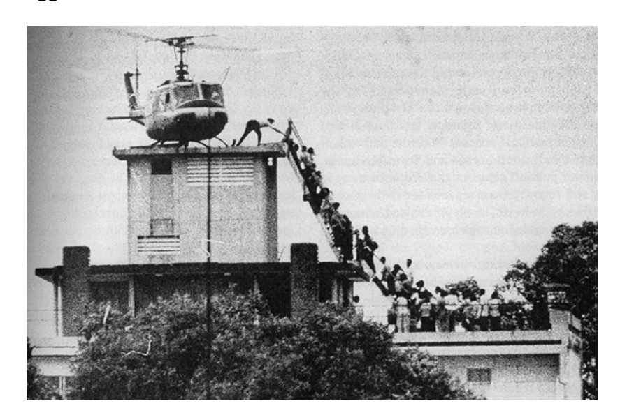
Figure 1. Vietnamese civilians trying to board a U.S. helicopter near the U.S. embassy in Saigon, 1975.

I then charted the field of what I call "critical refugee studies," a term which I will summarize at the end of the talk. Essentially what I wanted to do was to (re)conceptualize "the refugee" in academic discussion and popular discourse not as an object of rescue, but rather as a paradigm "whose function [is] to establish and make intelligible a wider set of problems" (Agamben 2002: 1) such as colonialization, war and displacement. Instead of looking at Vietnamese refugees as people that we assimilate and make into a success or continue to see as a problem, I argue that we should look at them as a critical site of social and political critique. As you trace their lives, other erased histories will become visible, like the history of U.S. colonialism