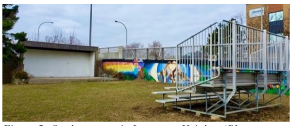
Figure 5: Outdoor stage in Lawrence Heights.

In 2012/2013 an outdoor stage (see Figure 5) was built in a previously underutilized green space, adjacent to Flemington Road and TCHC housing. It encompasses bleachers for seating and vibrant public art, which wraps the concrete retaining wall along Flemington Road that encloses the space.