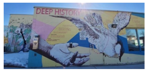
Figure 8: Deep Roots, Limitless Heights mural.

Limitless Heights mural. It was completed by youth