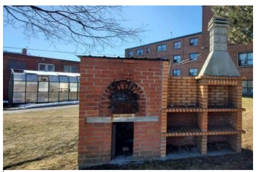
Figure 6: Pizza oven and greenhouse at 10 Old Meadow Lane.

This wall has been animated by residents and painted with artwork that highlights important local sites and services, community partners, common physical activities, and quotes including "perseverance until it happens". The stage serves as a 'third place' for the local community to host events, such as the annual Community Harvest Festival, the December Festival of Lights, Summer Thursdays, and open mic nights.