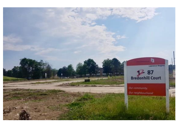
Figure 1: 87 Bredonhill Court, where TCH units once stood.

Lawrence Heights is a classic example of 1950s social housing design located in central Toronto, Ontario. The residential neighbourhood is bounded by Lawrence Avenue to the south, Yorkdale Avenue to the north, Varna Drive to the east, and Dufferin Street to the west. From a city planning perspective, Lawrence Heights is part of the broader mixed-income, mixed-use Lawrence-Allen community (Toronto,