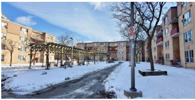
Figure 3: Interior courtyard of TCH in Neptune.

unacceptable (Valentine, 1990). Some adults in Lawrence Heights believe that improved street lightening could mitigate perceptions of fear and reduce crime-related activities, though they also acknowledge that there are youth in the community who feel differently—that improved lighting brings unnecessary attention. "Cameras can monitor courtyards. Inward-facing buildings