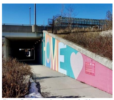
Figure 7: "Love or Love" mural.

need to thrive, regardless of race, zip code and family income". The non-profit believes that "a community that lacks access to quality playspaces also misses out on the chance to give kids the joys of childhood and the physical, emotional and social benefits of play" (KaBoom!, n.d.). This one-day event promoted community building and collective action. Approximately 100 community volunteers and hundreds of corporate employees came together to build this new playground in Lawrence Heights (City News Staff, 2006). Going forward, it will remain programmed green space and physical infrastructure that bolsters well-being for children and youth in the community.