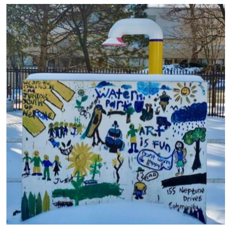
Figure 10: Public art by youth, on utility box in TCH splash pad.

Lawrence Heights is unlike many other communities in that its public art is a direct reflection of the community. The artists are consciously locally hired or inspired. Dillon Consulting's urban planner, Miriam Bart, confirmed that Lawrence Heights is an anomaly among many neighbourhoods in Toronto and the GTA, such as Oakville, that are often more interested in the work of global architects who can produce a defining feature that draws wider attraction and tourism. Such formal placemaking efforts consciously brand a place and approach public art from an economic development perspective (Garcia et al., 2019). Drawing on her current planning work related to