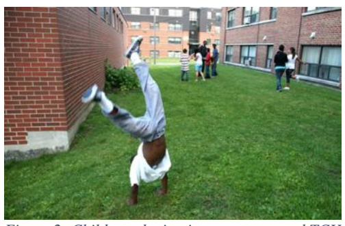
Figure 2: Children playing in unprogrammed TCH green space. (Source: Toronto, 2012a)

Expanding on these thoughts regarding cultural and aesthetic biases, I reflect on different opinions regarding what is deemed aesthetically pleasing. De Vries et al. (2013, p. 28) believe that the perceived aesthetics of green and public spaces is dependent on "maintenance, orderly arrangement", overall impression, related experiences, subjective and objective qualities. Green and public spaces that are