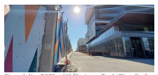
Figure 4: New POPS at 160 Flemington Road.

Privately-Owned Publicly-Accessible Spaces (POPS) introduce additional challenges with navigating the ability to access, use and animate public and green spaces. There are nuances attributed to POPS. Public use is welcome until behaviours deemed unacceptable result in confrontations with private security and defensive control measures. For instance, the newly developed condominium at 160 Flemington Road has