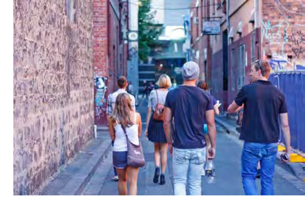
Ladder Hoddle St. Mentoring

A second option – enhanced accommodation - builds on the key adaptations of transitional housing and Housing First models in recent years, which has been to move towards a less institutionalized environment by offering smaller settings and in some cases uses dispersed housing in the community or a scattered site approach<sup>4</sup>. This means that young people experience greater independence by living alone or in small groups, and still have access to supports that are portable. The key advantage here is that young people are supported in their transition from homelessness in a way that reduces stigma and offers more opportunities to integrate into the community, provides greater control over tenure, and is an alternative to an institutional living environment (Novac et al., 2009; Nesselbuch, 1998). At the same time, residents are not yet fully responsible for their leases, or required to earn sufficient income to live in these more independent settings. In the case of young people leaving care (group homes) or juvenile detention, in