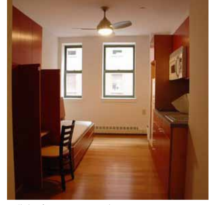
Chelsea foyer common ground www.housingpolicy.org/gallery/entries/The_Christopher.html

The Chelsea Foyer in New York is a partnership between Common Ground (a housing provider for low income and formerly homeless adults) and Good Shepherd Services (a leading foster care and youth development provider). It is different from most Foyer buildings in the UK in that it is a 40 unit independent residence that is part of the larger Common Ground's 207 unit permanent supportive housing complex for low-income and formerly homeless adults. As of 2009, the Chelsea Foyer had served 165 young people between the ages of 18 and 25. As in the UK, the maximum stay is two years.