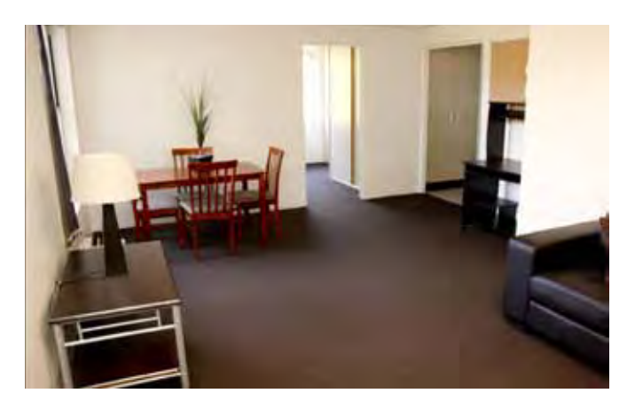
Southern Youth and Family Services (Australia) www.syfs.org.au

The Garden Court Foyer (see case study) is an innovative model that involves a main facility combined with dispersed units. An evaluation of the Garden Court showed strong results in terms of improved living situations (once people left the Foyer), skills levels, safety and participation in education, training and/or employment (Illawarra Forum, 2008).