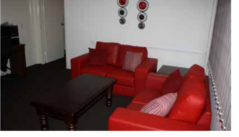
Southern Youth and Family Services (Australia) www.syfs.org.au