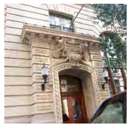
The Chelsea Foyer, New York City, NY

youth that has been growing in popularity around the world over the past two decades, and can most certainly can be adapted to the Canadian context. The real possibilities for community adaptation emerge when one considers how the model may be modified based on advancements in our thinking about housing and support developed in Canada and elsewhere, including Housing First, dispersed housing models with mobile supports, and the notion of convertible leases, as discussed in the previous section.