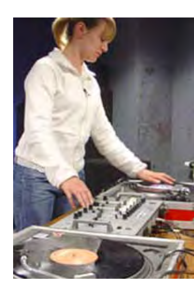
Aberdeen Foyer music www.aberdeenfoyer.com/music.html

There is a wide body of research that shows successful physical, psychological, emotional and social transitions from childhood to adulthood require strong adult support (including mentoring), opportunities to experiment and explore (and to make mistakes), learning to nurture healthy adult relationships (including relationships), the gradual learning of skills and competencies relating to living independently and obtaining a job, etc. Unfortunately, when young people become homeless or are in crisis, many of these assumptions about adolescent development are abandoned in the rush to make