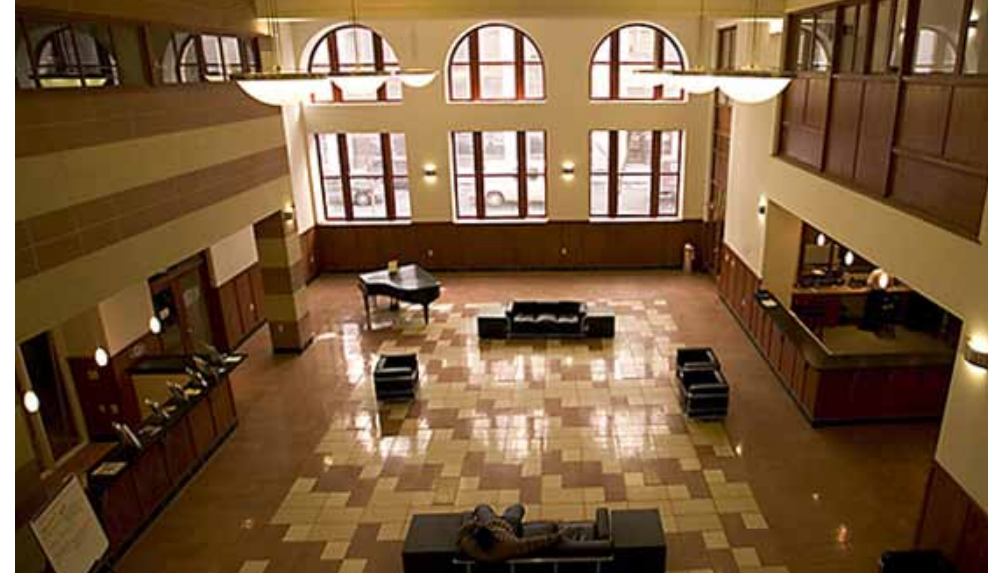
Chelsea foyer common ground www.housingpolicy.org/gallery/entries/The_Christopher.html

The Chelsea Foyer has a higher concentration of residents with high needs (mental health, addictions) than is typically the case in the UK. Staff have found that it is possible to have peer mentoring even within a high-needs community. Although the Chelsea Foyer has no dedicated aftercare service, participants are encouraged to keep in touch with program staff, and are invited to attend and participate in regular alumni events. The Chelsea Foyer does however have the Good Sheppard Volunteer program in which a college student commits to volunteering for a one-year term and maintains contact with youth once they have been discharged. The student maintains contact via social media outlets like Facebook, which has proven more effective than relying on contact with participants via telephone, due to constantly changing numbers.