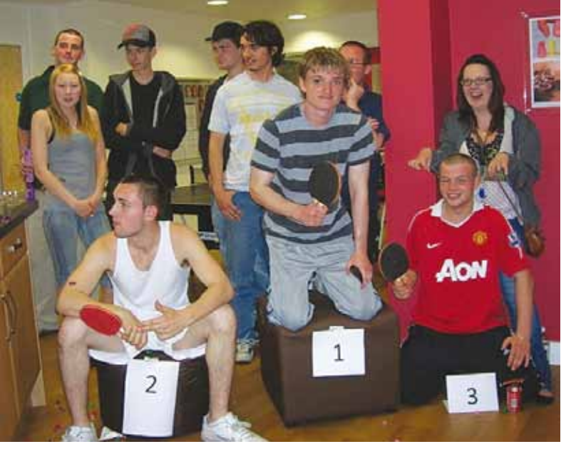
Step by Step Crimea Road building (UK) www.stepbystep.org.uk/news-info/prel/UKHousingAwards2012.htm

The staffing model we present here is from the Chelsea Foyer in New York: