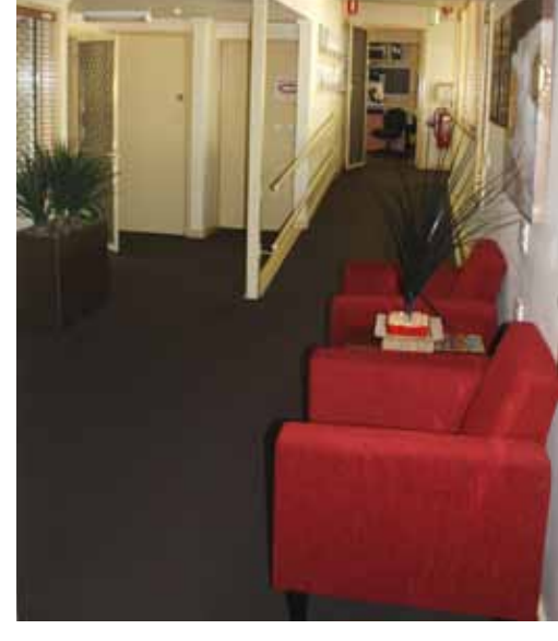
Southern Youth and Family Services (Australia) www.syfs.org.au

There are many clear advantages to the dispersed Foyer model, however. First, because it is not associated with a single facility, it can feel less like a 'program' or an institutional setting for residents. This may be particularly effective to young people leaving homes or juvenile detention facilities. Second, support for sub-populations (young