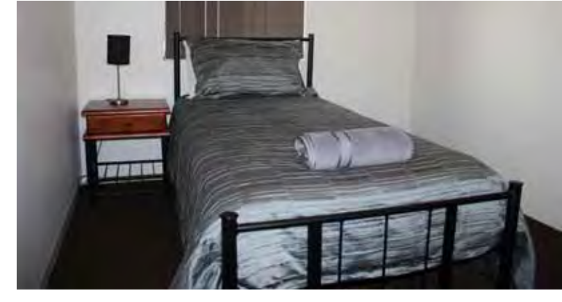
Southern Youth and Family Services (Australia) www.syfs.org.au

In spite of these promising results, there are some concerns about whether the Housing First model can really work for all youth. Since the implementation of Housing First may be problematic in tight housing markets with low vacancy rates (Gaetz, 2011), the question becomes how to overcome the