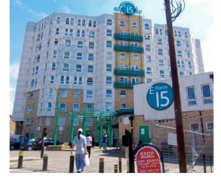
Focus E15 Foyer London (UK). www.east-thames.co.uk/focus-e15

How do we know the Foyer model is effective, and will make sense in the Canadian context? In this review, we provide descriptions and case studies. In addition, we address the effectiveness of such interventions. One of the strengths of the Foyer model is that it has been extensively evaluated in Australia, the United States and the UK, and the reports that we draw on provide valuable insight into the outcomes, strengths and challenges of the model. Below is a summary of they key findings.