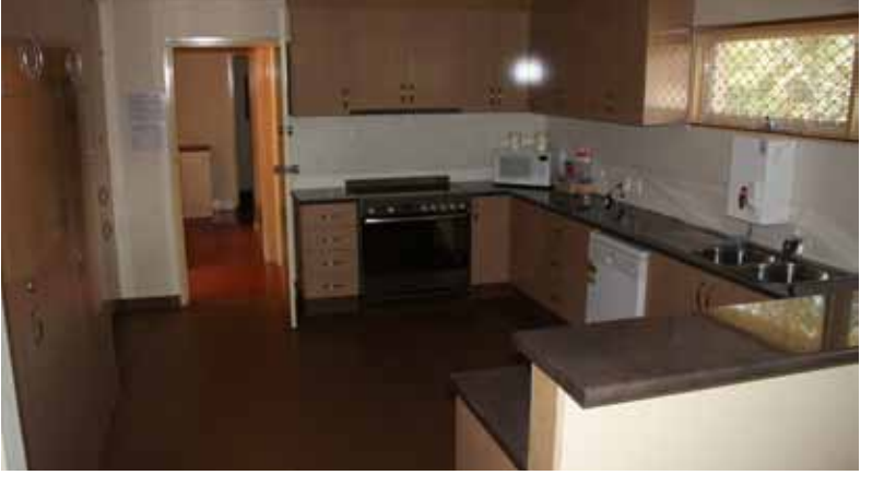
Southern Youth and Family Services (Australia) www.syfs.org.au

a number of dispersed units as well, allowing older youth who are more independent or who are averse to the more institutional context the opportunity to live in smaller units that are integrated into the community. The Garden Foyer in Wollongong, New South Wales (Australia) offers a particularly interesting example of a hub and spoke model.