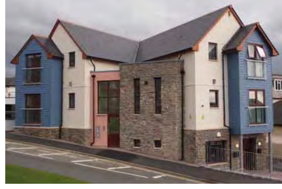
The Stonham Bude Foyer in Summerleaze Crescent (Cornwall, UK) offers local young people accommodation and practical help.

to the individual. This approach creates a pathway from higher levels of supports to independent living. Young individuals with little independent living experience may prefer a housing option where they are not responsible for the lease, but in time, as they obtain greater independence, the lease is transferred to their name. In this context, and depending on their need, some level of supports may continue. The advantage of this transitional housing approach, which has been implemented in Canadian settings (Eberle et al., 2007; Millar, 2009), is that there is no set length of stay, and young people are able to assert more control and independence as they age. In Australia, the Youth Head Lease Transfer Scheme (now part of the "Same House, Different Landlord" scheme) has been in place for several decades (Leebeck, 2009). This convertible lease program has evolved over time, and evaluations have shown its effectiveness in supporting the transition to independent living of formerly homeless youth (Queensland Department of Housing, Local Government and Planning, 1994). Another innovation of the transitional housing approach in Australia is